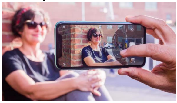
Lighting - Light not only defines your subjects but also sets the mood or evokes emotion. Experiment with light and be aware of where your main light source is.

Composition - To create compelling video, compose the elements in a scene or sequence deliberately. Think about each shot and what you want it to accomplish.